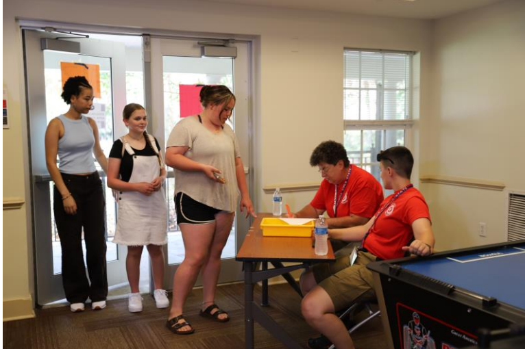
Sunday Registration 1:00 – 3:00