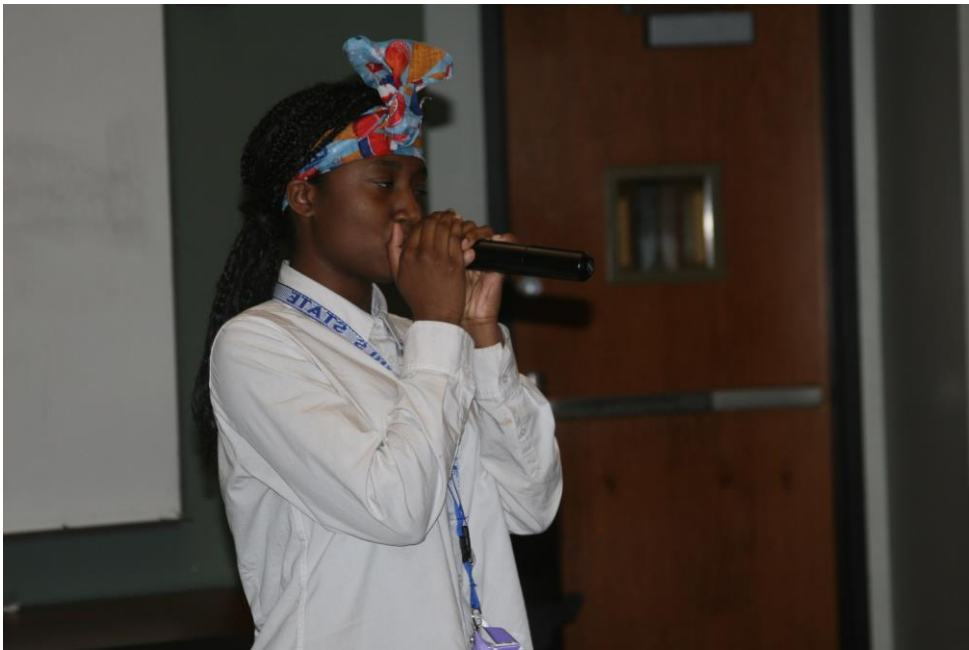
Talent Show and Staff Skit