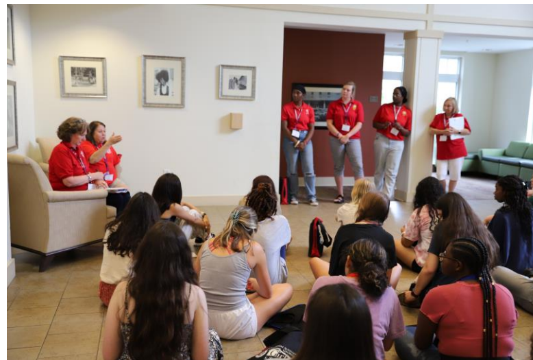
Orientation in City