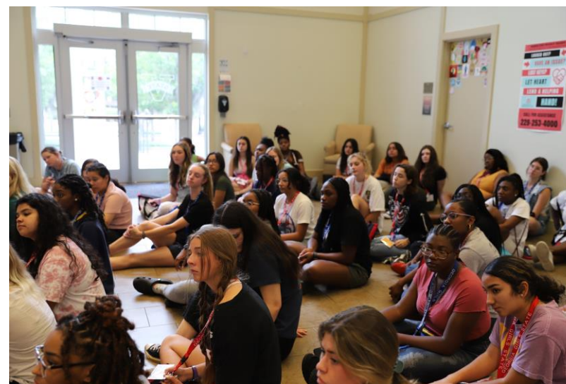
Orientation in City