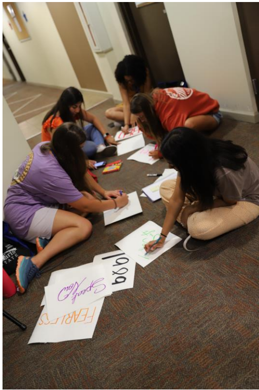
Making Campaign Signs