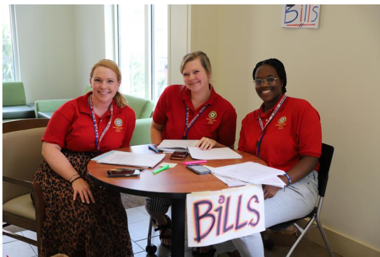
Government Staff Collecting Bills